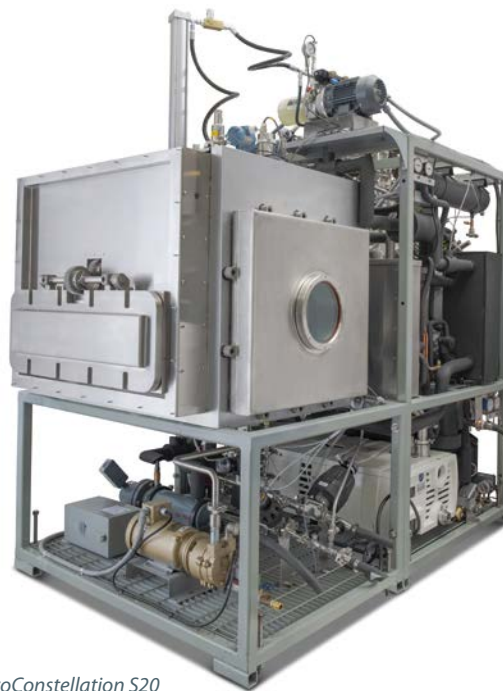
SP Hull LyoConstellation S20 Pilot Lyophilizer